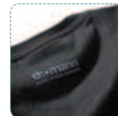
Thomann logo print on the back