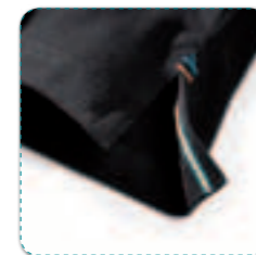
Orange and turquoise ornamental seams