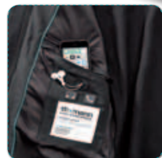
Inside mobile phone pocket with opening for headphone cable