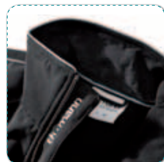
Silver and turquoise stitched Thomann logo