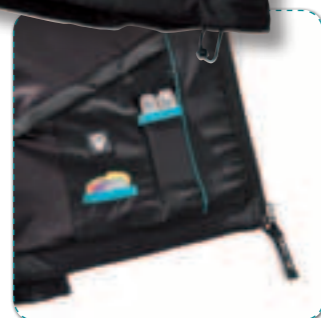
Inside pockets for guitar plectrums and multi-tool