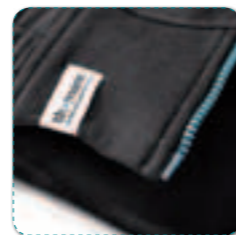
Thomann logo label on the seam