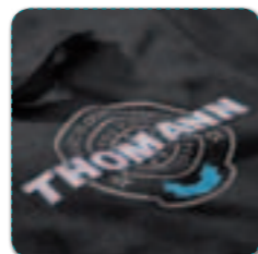
Intricate combination of print and embroidery