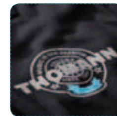
Logo print on left chest