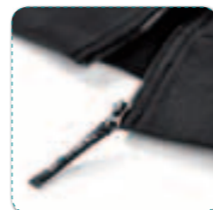
Embroidered zip tag with Thomann logo