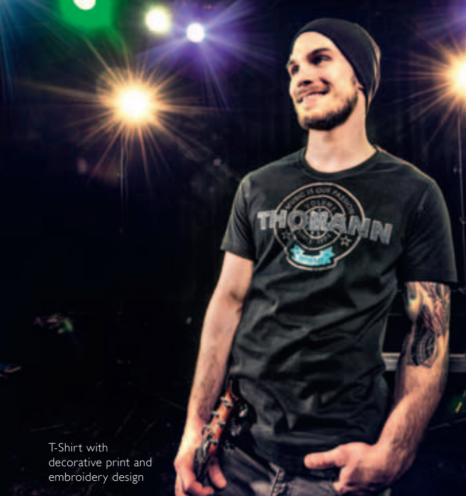
T-Shirt with decorative print and embroidery design